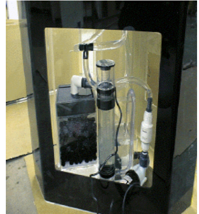
The exact configuration depends on the aquarium model you are choosing and each filtration system is designed to fit in Tenecor's aquarium stands and provide ample biological filtration for the aquarium.